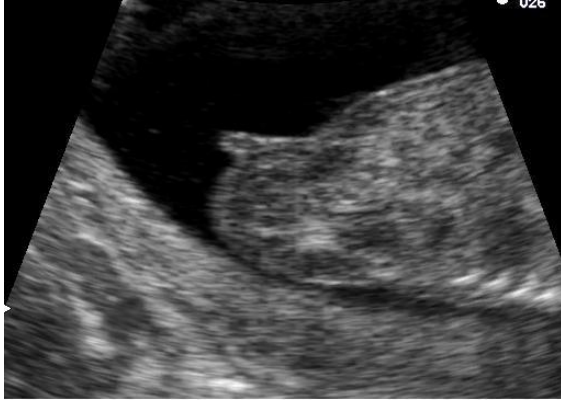
Genital tubercle at fourteen weeks

the tubercle are a pair of ridges called the labioscrotal swellings .