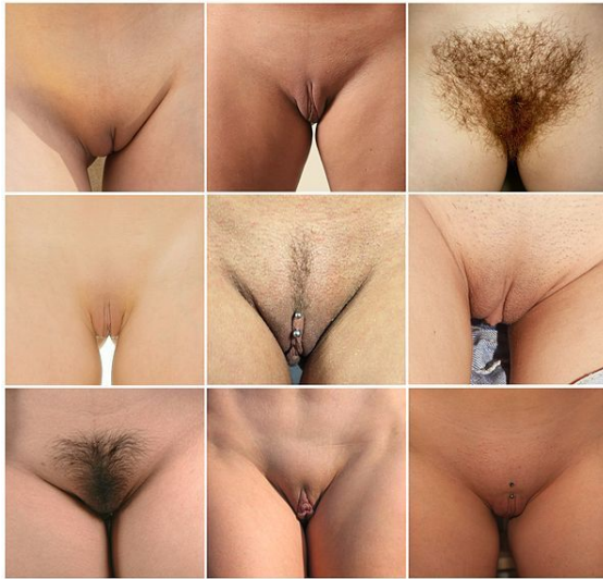
Variation in the appearance of women's external genitalia (genetic variation)

The soft mound at the front of the vulva is formed by fatty tissue covering the pubic bone, and is called the mons pubis . The term mons pubis is Latin for “pubic mound” and it is gender-nonspecific. There is, however, a variant term that specifies gender: in human females, the mons pubis is often referred to as the mons veneris , Latin for “mound of Venus” or “mound of love”. The mons pubis separates into two folds of skin called the labia majora , literally “major (or large) lips”. The cleft between the labia majora is called the pubendal cleft , or cleft of Venus , and it contains and protects the other, more delicate structures of the vulva. The labia majora meet again at a flat area between the pubendal cleft and the anus called the perineum . The color of the outside skin of the labia majora is usually close to the overall skin color of the individual, although there is considerable variation. The inside skin and mucous membrane are often pink or brownish. After the onset of puberty, the mons pubis and the labia majora become covered by pubic hair . This hair sometimes extends to the inner thighs and perineum, but the density, texture, color, and extent of pubic hair coverage vary considerably, due to both individual variation and cultural practices of hair modification or removal.