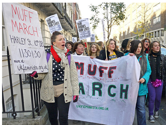
The Labia pride movement resents the ideals of female cosmetic genital surgeries: The Muff March in London, 2011

ation in the size of labia. The preference for small labia is purely a matter of fashion and is without clinical or functional significance. [15][16]