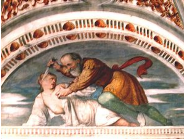
The murder of Virginia , by Romanino