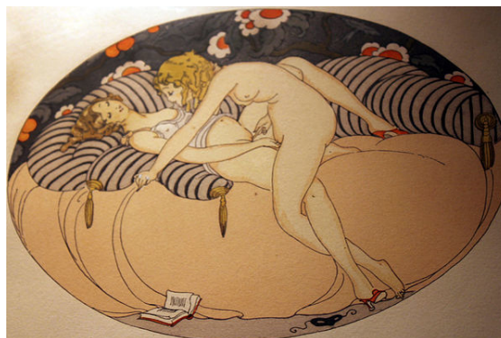
Wegener's 1925 artwork “Les delassements d'Eros” depicts two women.

Sexual activity can be classified in a number of ways. It can be divided into acts which involve one person, also called autoeroticism , such as masturbation , or two or more people such as vaginal sex , anal sex , oral sex or mutual masturbation . If there are more than two participants in the sex act, it may be referred to as group