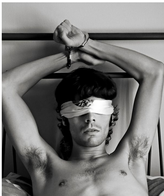
A man handcuffed to a bed and blindfolded.