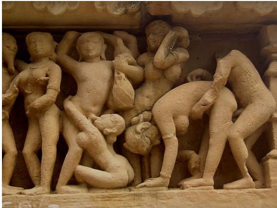
Erotic sculptures found in a medieval Hindu temple in India.

Most world religions have sought to address the moral