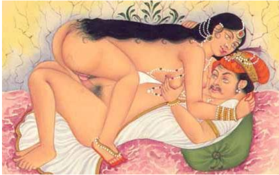
This Indian Kama sutra illustration, which shows a woman on top of a man, depicts the male erection, which is one of the physiological responses to sexual arousal for men.

The physiological responses during sexual stimulation are fairly similar for both men and women and there are four phases. [3]