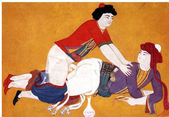
An Ottoman miniature from the book Sawaqub al-Manaqub depicting homosexuality .

press their sexuality in a variety of ways, and may or may not express it in their behaviors. [33] Research indicates that many gay men and lesbians want, and succeed in having, committed and durable relationships. For example, survey data indicate that between 40% and 60% of gay men and between 45% and 80% of lesbians are currently involved in a romantic relationship. [34]