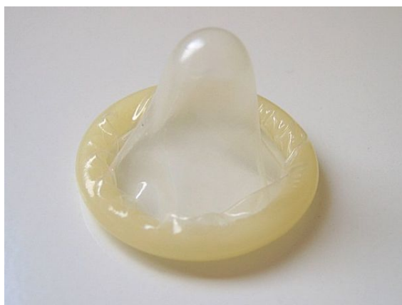
A rolled-up male condom

Main article: Sexually transmitted infection